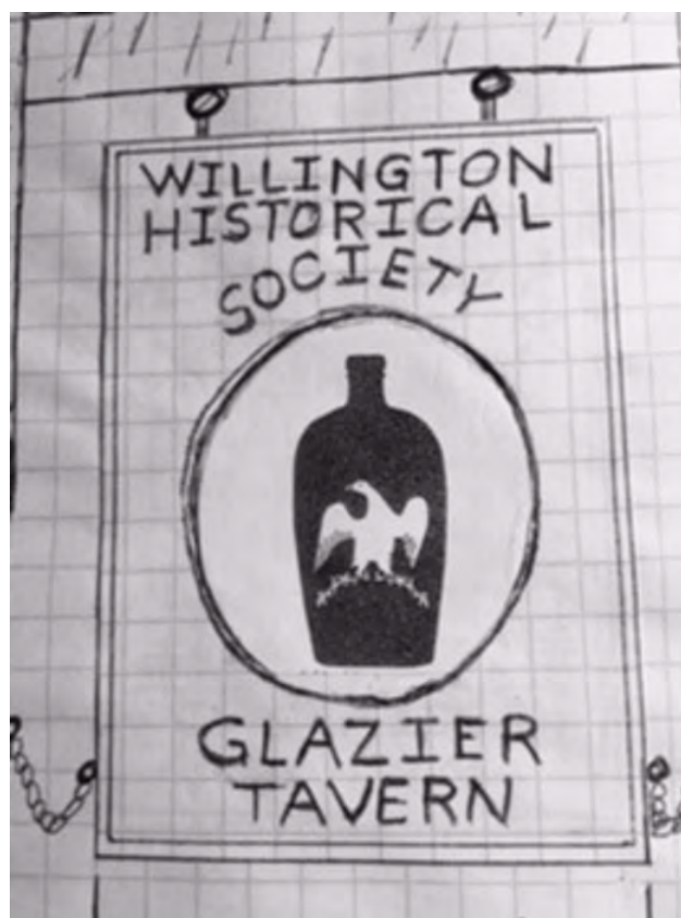
Drawing of proposed sign

Hopefully, this Spring or Summer the Society will be erecting a tavern type sign on the front lawn of the Glazier Tavern, at the intersection of Ct. Route 74 and Common Road. The sign will alert those passing by that the site is the home of the Willington Historical Society and the site of the historic Glazier Tavern. Look for the sign that features a central image of a representation of the Liberty flask produced by the Willington Glass Company. The flasks were manufactured by the glass company in the 19 th century and are still highly sought after by antique glass collectors. As you might have already noticed while driving by, the support posts have been installed. If you don't frequent the area of the tavern building, check out the photos posted on FaceBook and "like" us!